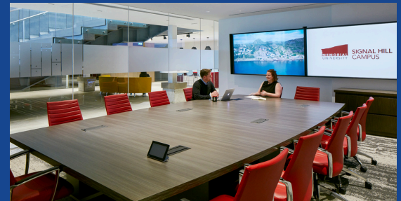
Smaller Meeting Rooms EIX SHC

Basic Audio Visual equipment included with booking. Capacities vary depending on space. Contact meet@mun.ca for options.