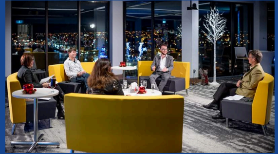
Main Conference Hall EIX SHC

From finding the perfect space, to support in planning and executing your event - including in-house AV and onsite catering - the Memorial Conference and Event Services team is here to make sure every Memorial event meets the mark.