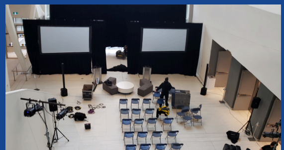
Whale Atrium Core Science Facility SJC